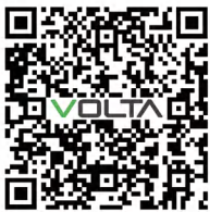
Google play Download