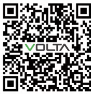
IOS APP Download